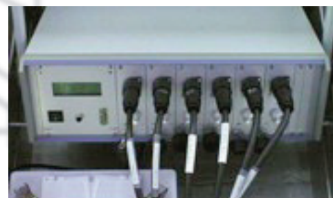
LLF-M with 6 signal channels