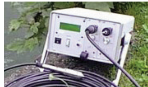
LLF-M with 2 signal channels